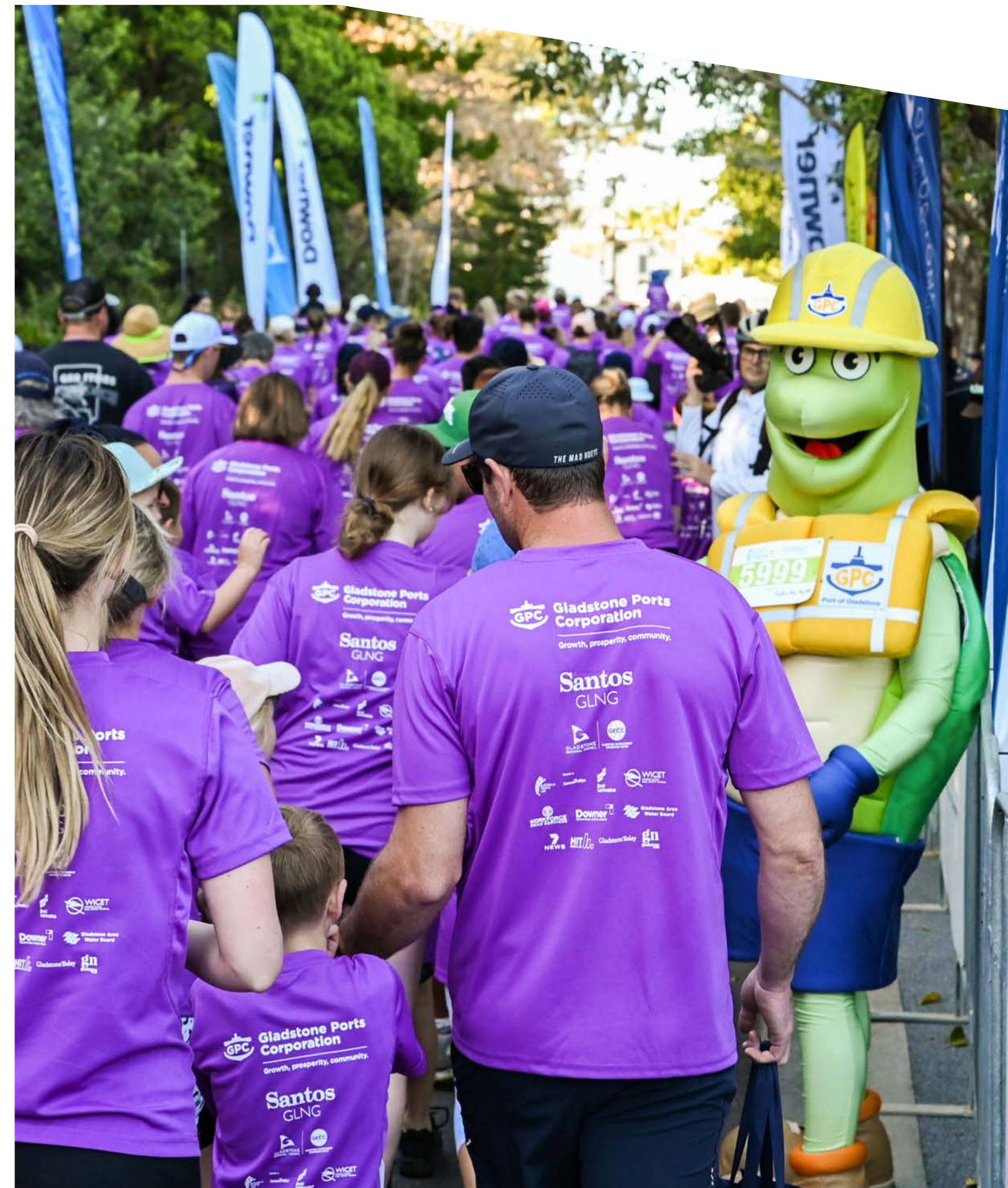
PHOTO: Gladstone Ports Corporation's 2022 Port to Park Fun Run.

Generally, the events or activities that GPC supports through the Grants and Donations category are free for all attendees or have a nominal admission fee to participate.